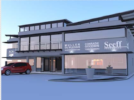
• Business Centre - Langebaan