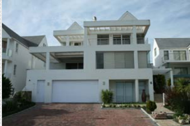
• New House - Langebaan