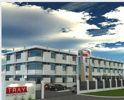
• Tray International - Cape Town