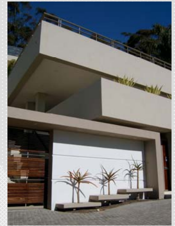
• Alterations - Fresnaye