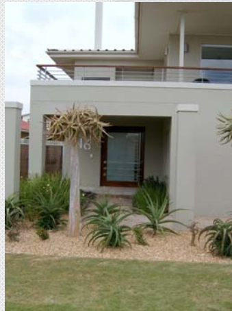
• New House - Langebaan