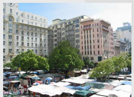
• Greenmarket Place - Cape Town