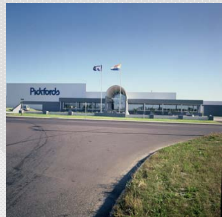
• Pickfords Complex - Eppingdust