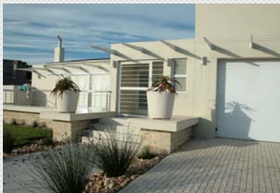
• New House - Langebaan