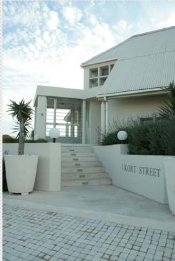
• Alterations - Langebaan