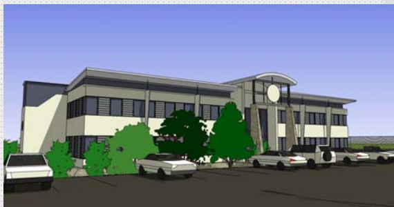
• Robertson & Caine - Atlantis