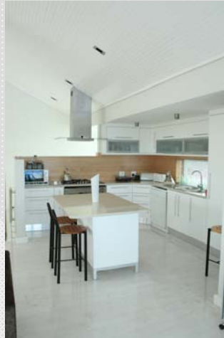
• New House - Langebaan