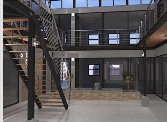
• Business Centre - Langebaan