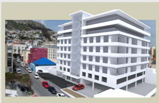
• Solomon Road - Bantry Bay