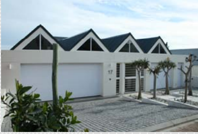
• New House - Langebaan