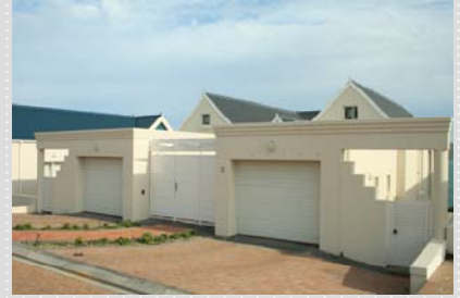
• New House - Langebaan