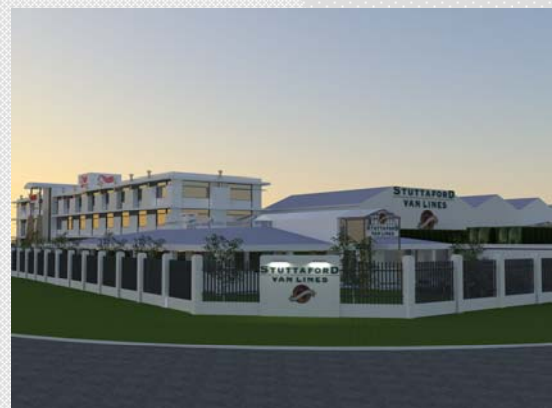
• Stuttforde Van Lines - Cape Town