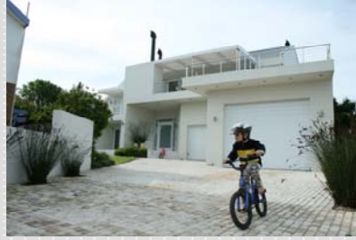
• New House - Langebaan