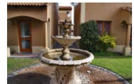
Via Firenze residential complex, Parklands, CT