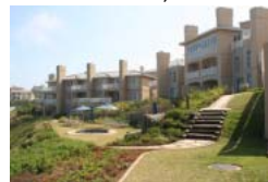
Luxury Golf Villas, Pinnacle Point, Mossel Bay