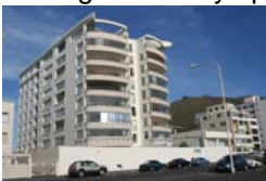
The Breakers luxury Apartments, Cape Town

St. Tropez townhouse complex, Hout Bay, Cape Town CPI House, Offices & loft apartments, Cape Town Golf Villas, 26 block of luxury villas, Pinnacle Point Various houses, Klein Karoo, Southern & Western Cape Private residence, Tuscan Villa, Durbanville, Cape Town Via Firenze residential complex, Parklands, Cape Town Sol Kerzner's residence at Leeukoppie – documentation