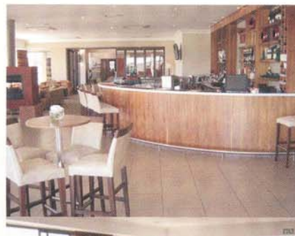
Ebōtse's brand-new 19th is classy and comfortable.

The wisdom of moving their main bar downstairs can be queried, but this is still a great place for post-round conversation in good company.